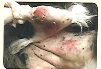
Typical photo of a suspected case of Alabama Rot with skin lesions and associated evidence of kidney failure

Typical presenting signs include ulcerated and abnormal lesions on dogs' skin, especially the lower legs, paws and face. It can, in rare cases, cause acute kidney failure by producing multiple small blood clots within the tissue, leading to kidney cell death, which is of course very serious. Fortunately it is still very rare and additionally, most skin lesions will not be related to Alabama Rot; however, if you notice any unusual skin patterns on your dog's skin and need any advice please contact us straight away at the surgery.