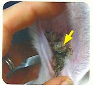
In rabbits, ear mite infestations with the rabbit ear mite ( Psoroptes cuniculi ) present with thick, flakey crusting in the external ear canal.