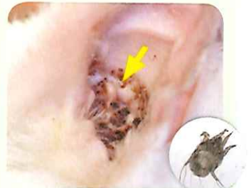
Opening to the vertical ear canal in a cat with a crusty brown discharge typical of ear mites Otodectes cynotis (inset)